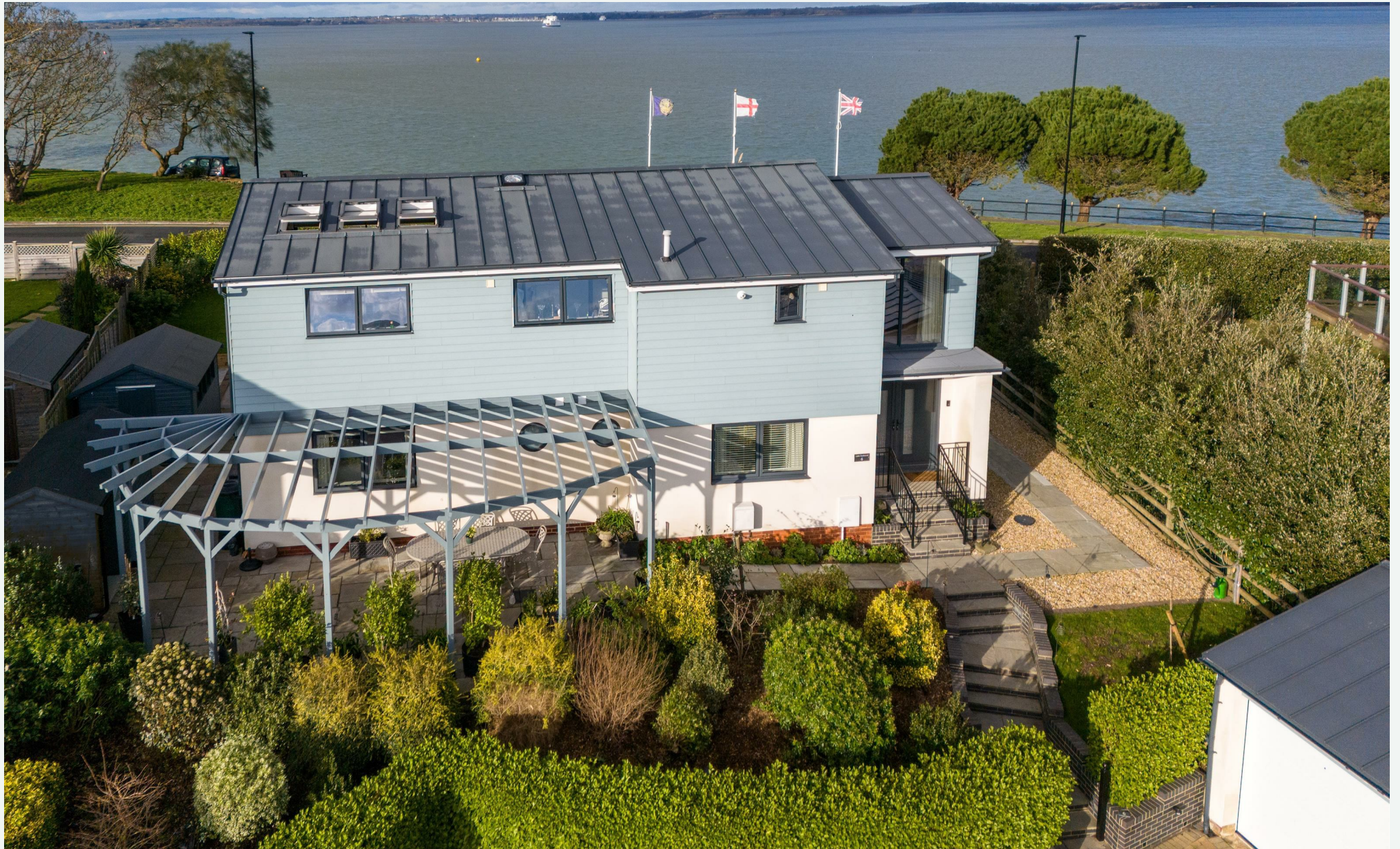
Little Dashwood 6 The Mount, Yarmouth, Isle of Wight, PO41 0RB